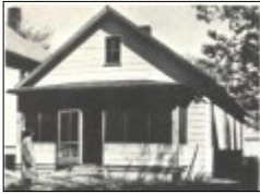
Mission Sunday School, Jessamine Street —1885