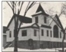
First Chapel Erected, Case & Edgerton—1902