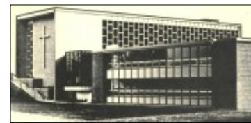
Education Wing Addition —1967