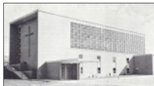
New Building, Magnolia Avenue— 1959