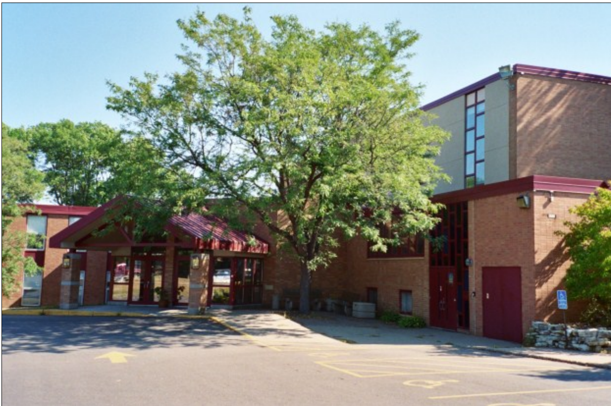
2-Story Office/Storage Addition—1985 Narthex, Elevator, Southern Entrance Addition—1990